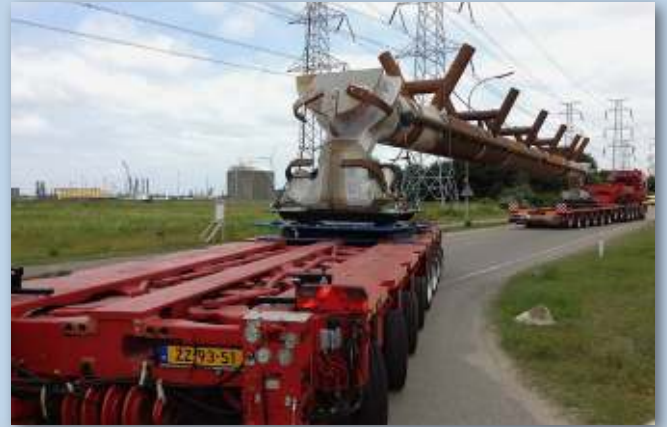
Heavy and Long Transport