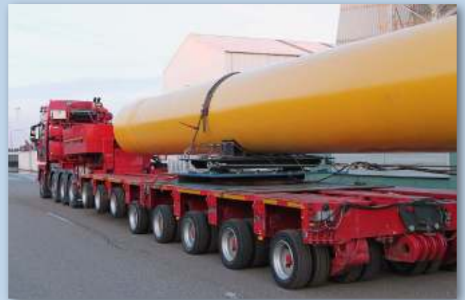
Bearing plate for all maneuvers