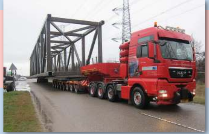
Transport Dimensions 6500mm(W) x 6500mm(H) x 40000mm(L) 98 m.T.