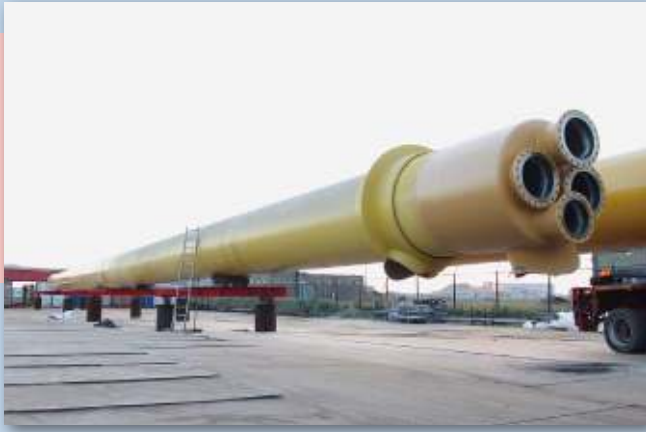
Ready for loading