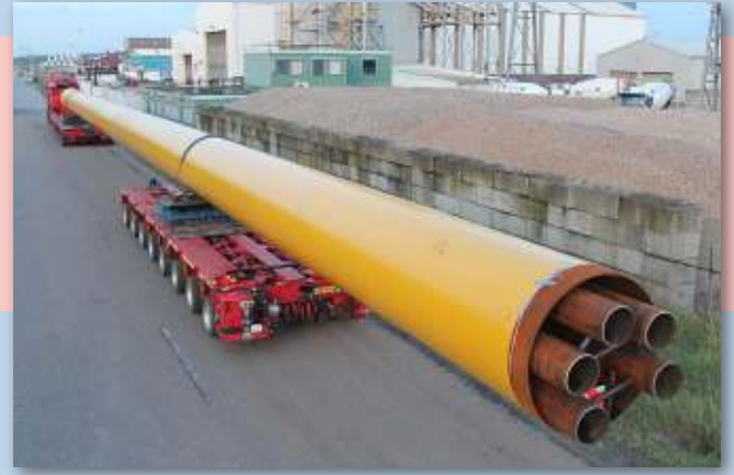
Ready to transport, 61400mm(L) and weight 93.6 m.T.